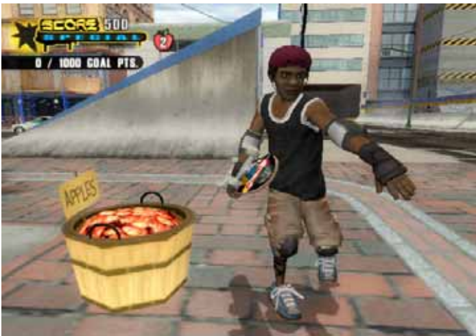
A Create-A-Skater lobs apples at unsuspecting victims.