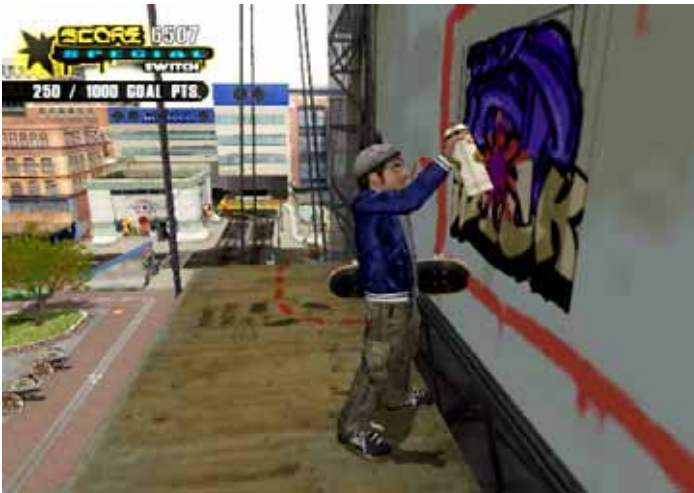
“Tagging” walls; one of the several new features to THUG2 .