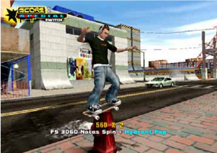
Colorful environments and classic THPS game play.